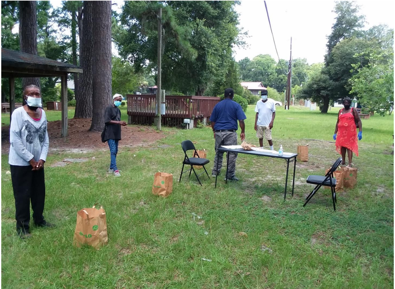
Food , Toiletries & PPE's Distribution at MLK Park on Saint Helena Island, SC