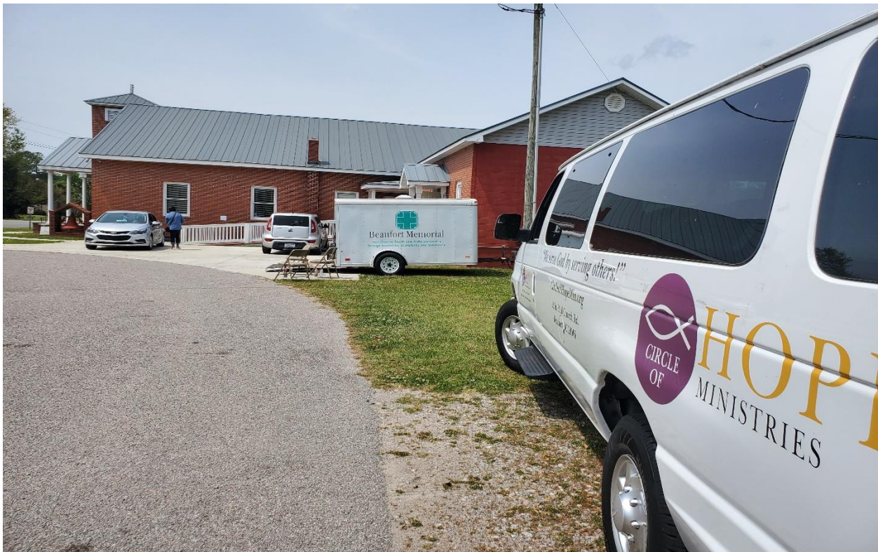
The Circle of Hope Ministries Transported our Homeless Brothers & Sisters to Mount Carmel Baptist Church for Covid 19 Vaccinations Administered by Beaufort Memorial Hospital Mobile Medical Team