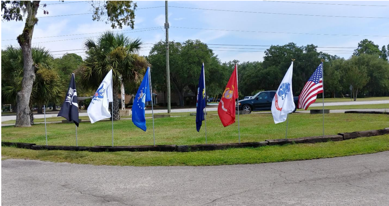
Flag Display at the Veterans 1 st Thrift Store, 612 Robert Smalls Pkwy (Hwy. 170) Beaufort, SC