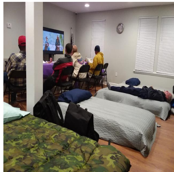
Multipurpose Room for Emergency Shelter